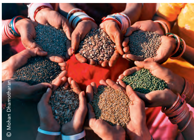
Genetic engineering has accelerated the industrialization of agriculture and may lead to a contamination of genetic resources by transgenes. The picture shows a variety of local vegetable seeds presented by a group of smallholders in India.

as the unfashionable older cousin of genetic engineering” (Knight 2003). Today, the concentration in the seed sector can be considered the most serious factor responsible for the reduced genetic diversity of agricultural crops.